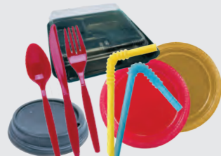
Plastic Utensils, Straws, Cup Lids & To-Go Containers