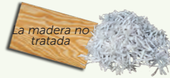
Untreated Wood, Shredded Paper