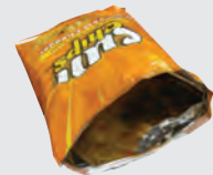
Snack & Chip Bags, Candy Wrappers

Surcharges may apply if cart is overfilled.