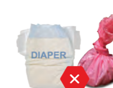
No diapers or pet waste