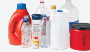
Empty Plastic Bottles & Jugs (Lids should be left on after emptying)