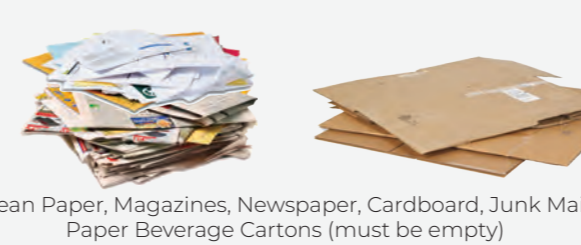
Clean Paper, Magazines, Newspaper, Cardboard, Junk Mail, Paper Beverage Cartons (must be empty)

Surcharges may apply if contamination is found.