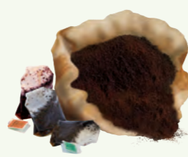
Coffee Grounds & Tea Bags