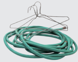
Wires & Hoses