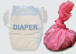
Diapers & Pet Waste