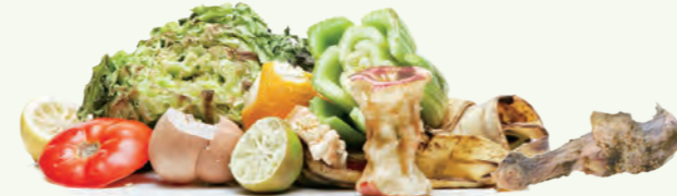
Food Scraps, Including Egg Shells, Meat & Bones

Surcharges may apply if contamination is found.