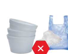
No polystyrene foam No plastic bags/film