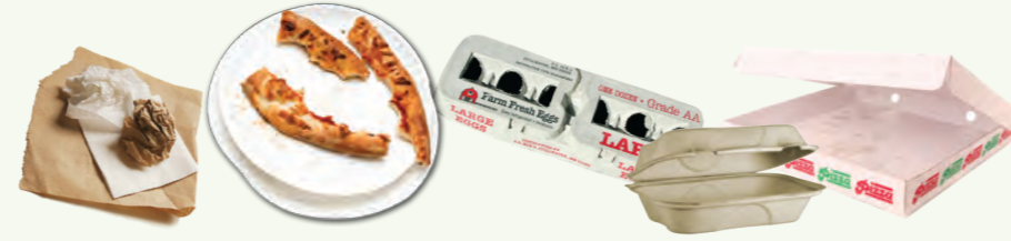
Food Soiled Paper, Napkins, Paper Towels, Pizza Boxes, Cardboard Egg Cartons, Non-coated Take-out Containers & Paper Plates (No surface sheen)