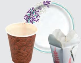
Disposable Drink Cups, Plastic Lined/ Coated Plates & To-Go Containers (With Surface Sheen)