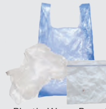
Plastic Wrap, Bags & Other Plastic Film