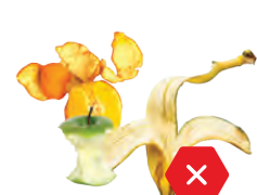
No food or liquids.

State Law SB1383 requires all organics and recyclables to be sorted.