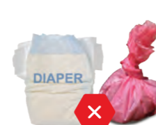
No diapers or pet waste