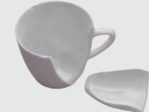
Broken Glass & Dishes