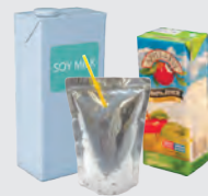
Drink & Beverage Cartons, Boxes / Pouches (Multi-Material Packaging)