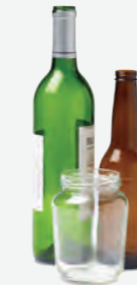
Empty Glass Bottles & Jars (Even broken)