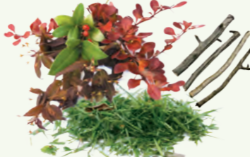
Yard Waste, Untreated Wood