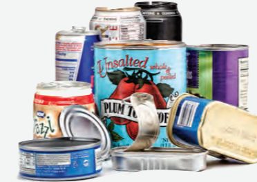
Empty Metal Beverage & Food Cans, Aerosol Cans, Clean Aluminum Pans & Foil